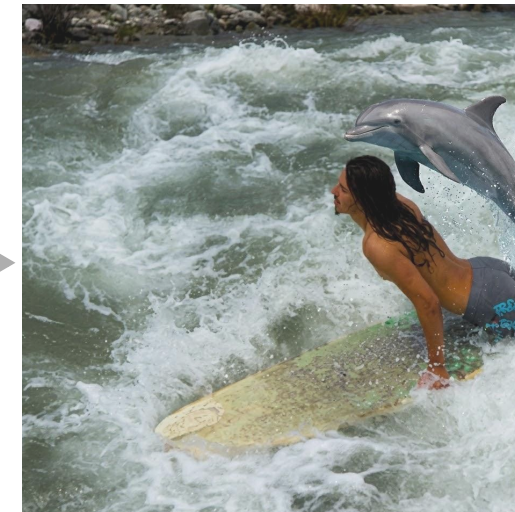
w/ Gemini 3.1 Pro