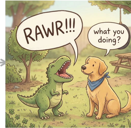
w/ Gemini 3.1 Pro